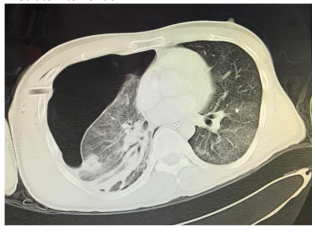
Figure 3: Collapse right lung with presence of bleb and bullae on thorax CT scan

other hand, may manifest with haemodynamically instability and silent lung. The latter condition requires immediate intervention.