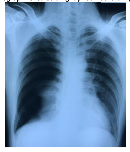
Figure 1: Right pneumothorax on initial chest radiograph

Routine blood investigations such as full blood count, renal profile and arterial blood gases were unremarkable. Chest radiograph revealed a right pneumothorax. (Figure 1)