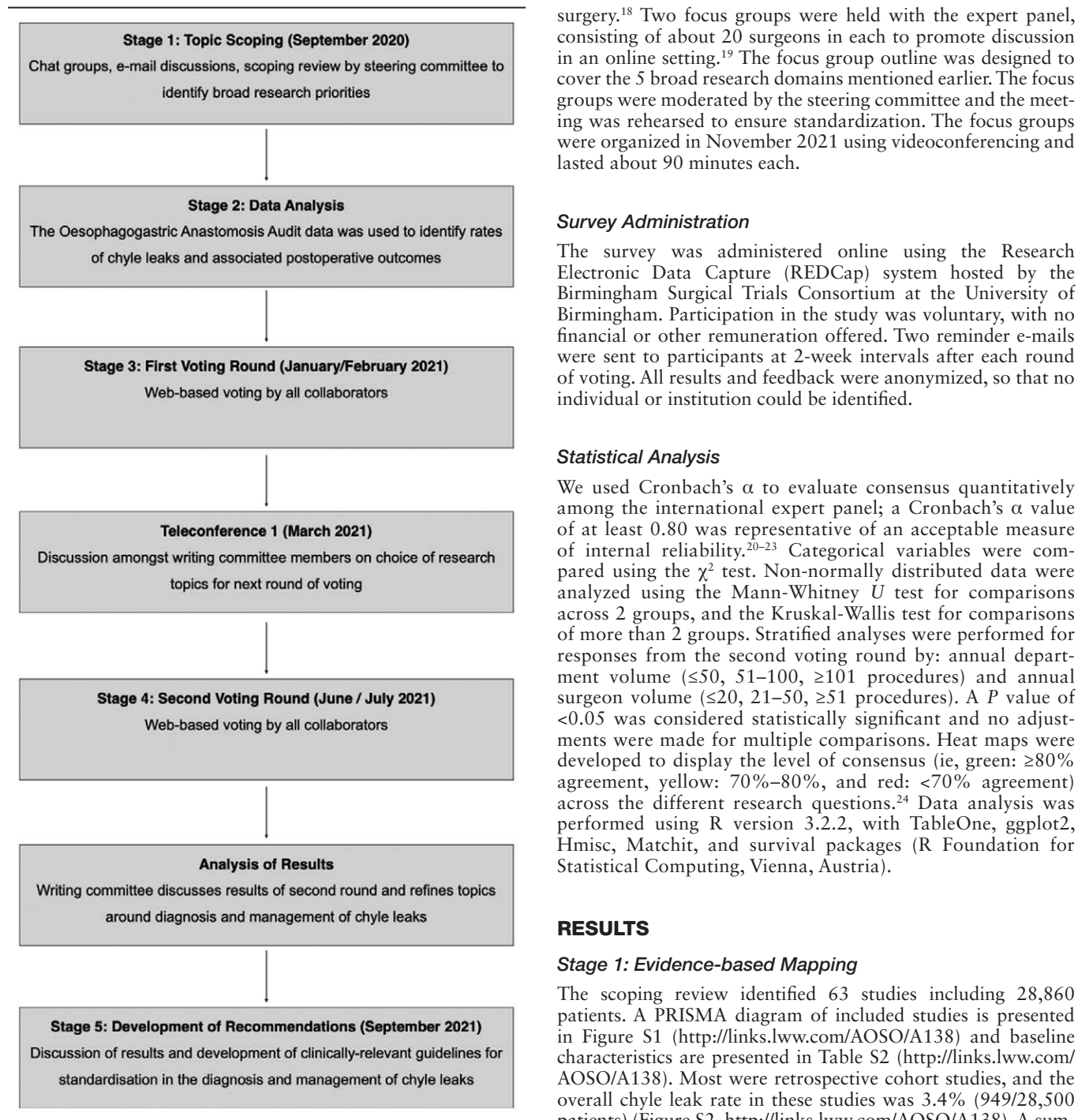
FIGURE 1. Overview of Delphi exercise to gather consensus surrounding risk factors, diagnosis, and management of chyle leaks after esophagectomy.

were excluded. Following the 2 rounds of voting, the questions across the 5 research domains were quantified by the proportion of agreement (ie, respondent selecting agree or strongly agree) \geq 80\% .<sup>17</sup> Further, thematic analyses of free-text responses for each domain were analyzed and reported.