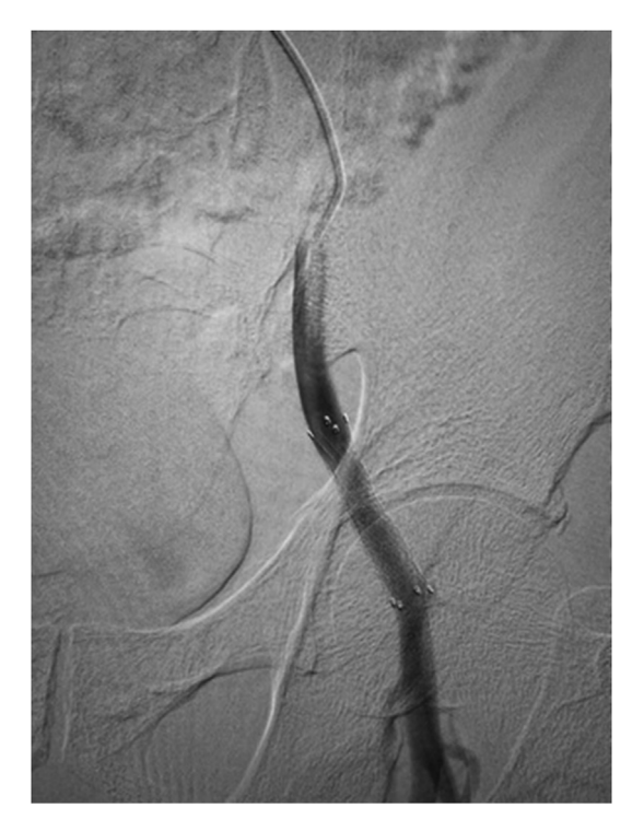
Fig. 3. Angiogram image of stent placement over left external iliac artery.

Blunt traumatic injury to the common and external iliac artery is rare as it is anatomically protected by the pelvic bone. When injury