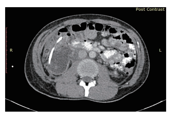
Fig. 3. Axial cut section of computed tomography abdomen showing the tip of pig tail catheter traversing into right colon.

However, due to worsening abdominal pain a repeat CT scan of the abdomen was performed which revealed an enlarging perinephric collection (Fig. 2). An attempt was made at retrograde ureteral stenting initially for urinary diversion as decided by the attending urologist in view of persistent urinary extravasation from the injured pelvicalyceal system. However, the attempt was unsuccessful and a percutaneous nephrostomy was requested. Due to technical difficulty, the cannulation of pelvic-calyceal system was unsuccessful and the tip of a pigtail catheter (sized 8 Fr) was placed within the perinephric collection instead for drainage of the resultant urinoma.