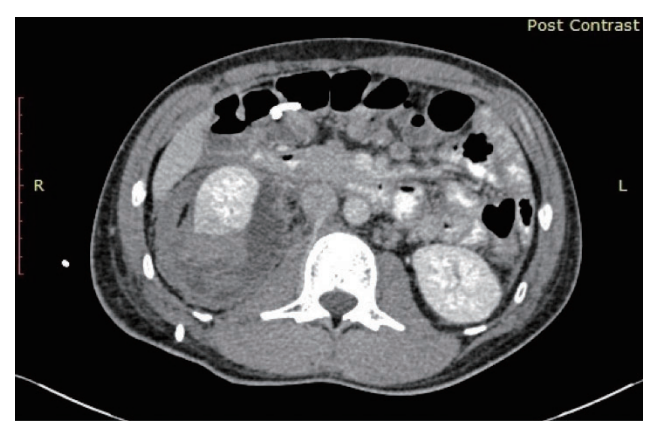
Fig. 2. Right perinephric hematoma expanded compared to day 1 scan.

However, due to worsening abdominal pain a repeat CT scan of the abdomen was performed which revealed an enlarging perinephric collection (Fig. 2). An attempt was made at retrograde ureteral stenting initially for urinary diversion as decided by the attending urologist in view of persistent urinary extravasation from the injured pelvicalyceal system. However, the attempt was unsuccessful and a percutaneous nephrostomy was requested. Due to technical difficulty, the cannulation of pelvic-calyceal system was unsuccessful and the tip of a pigtail catheter (sized 8 Fr) was placed within the perinephric collection instead for drainage of the resultant urinoma.